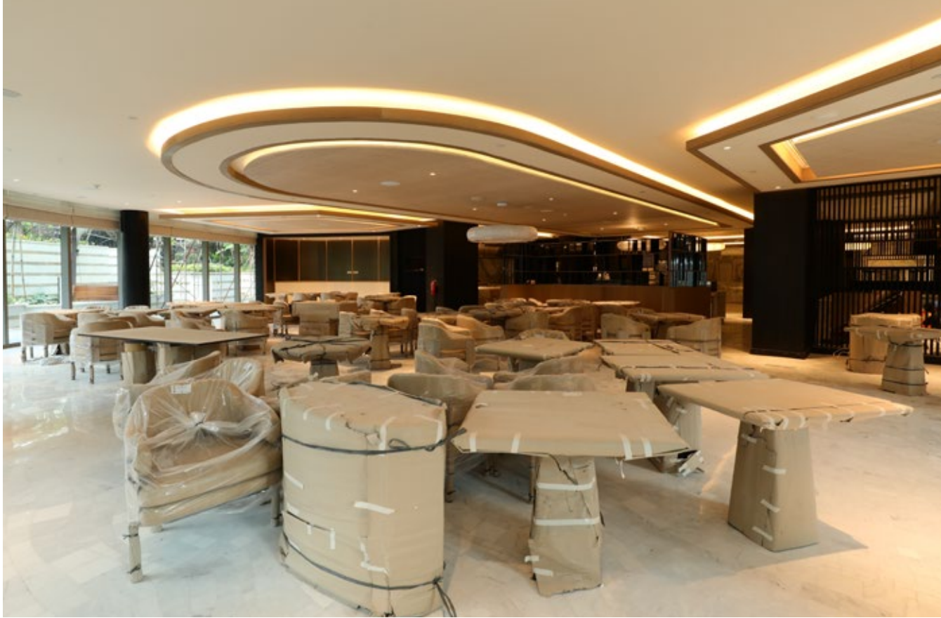
All-Day Dining. F&B counter installation is at 80%, furniture will be installed at end of August. Capacity for 220 pax.

The interior progress of the luxury hotel, St. Regis Jakarta at Jl. H.R. Rasuna Said is as follows: