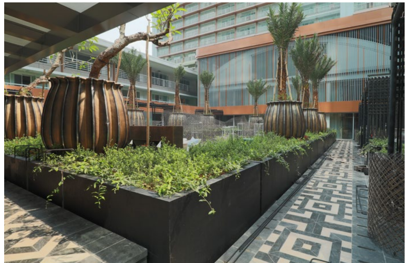
Palm Court connecting the hotel and Rajawali Place Office. Furniture is on site and will install artwork on September.