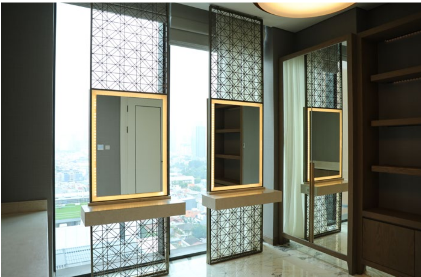
Salon Studio. Built-in millwork and interior is finished. 1 room for hair salon and another for nail that holds 2 pax each room.