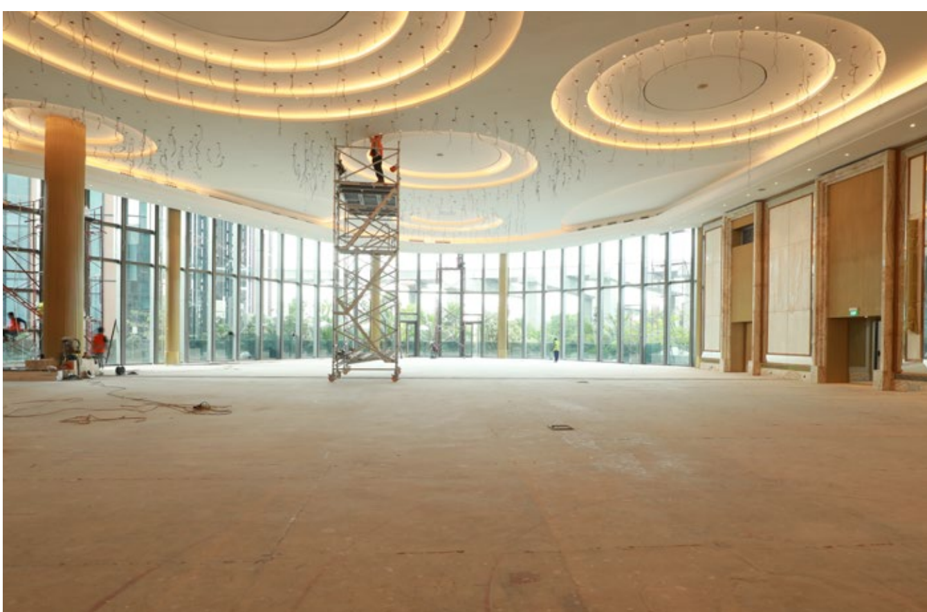
Astor's Ballroom chandelier and carpet installation will be at the end of August.