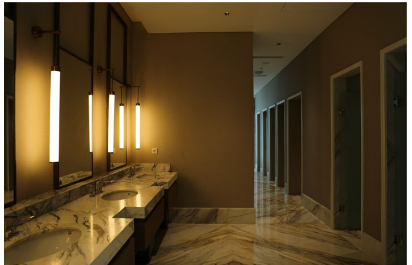
Changing Room. Steam and sauna will be finished in end of August. Finishing works is currently at 80%.