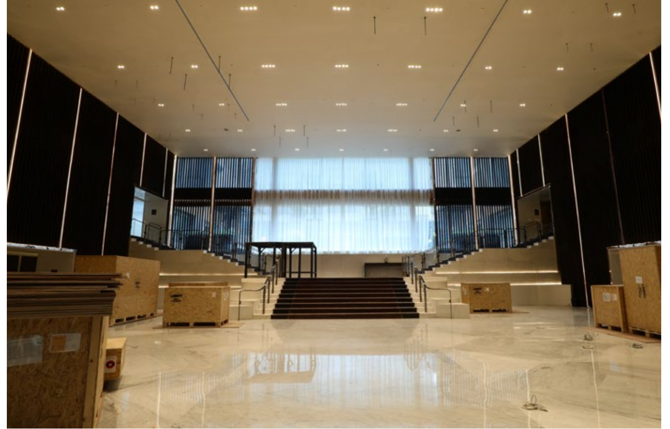
Great Hall Lobby. Lasvit chandelier will be installed on September, furniture already on site. Tea lounge and receptionist will occupy the hall.