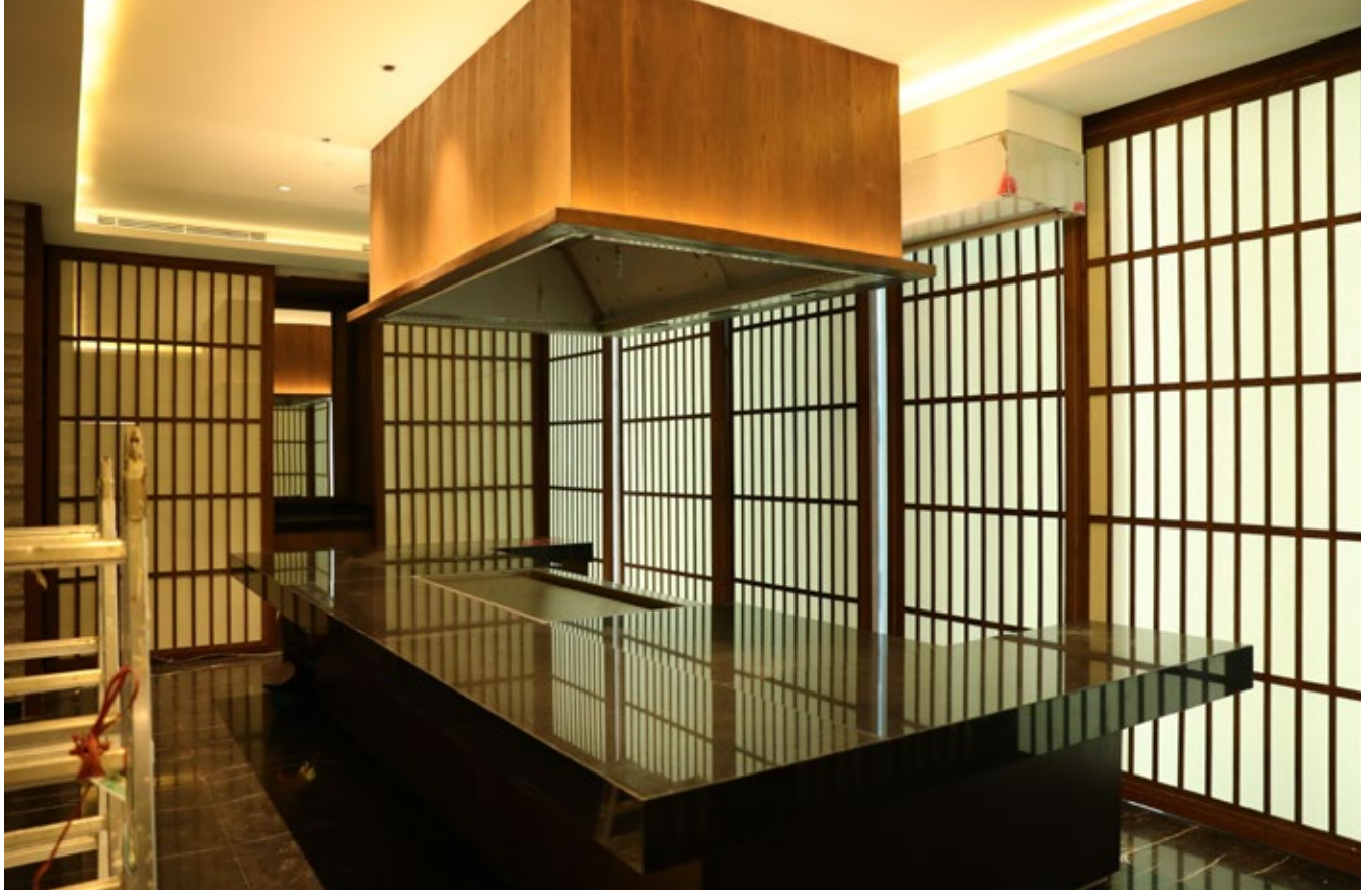
Teppanyaki Dining Room will test exhaust system on mid August. Furniture will be installed on end of August.

The interior progress of the luxury apartment, The Residences at The St. Regis Jakarta at Jl. H.R. Rasuna Said is as follows: