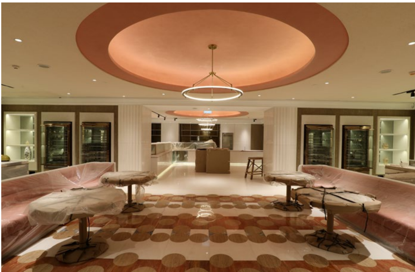
Rose Gourman Deli is progressing smoothly and is 85% done. Currently is still finishing defect process.