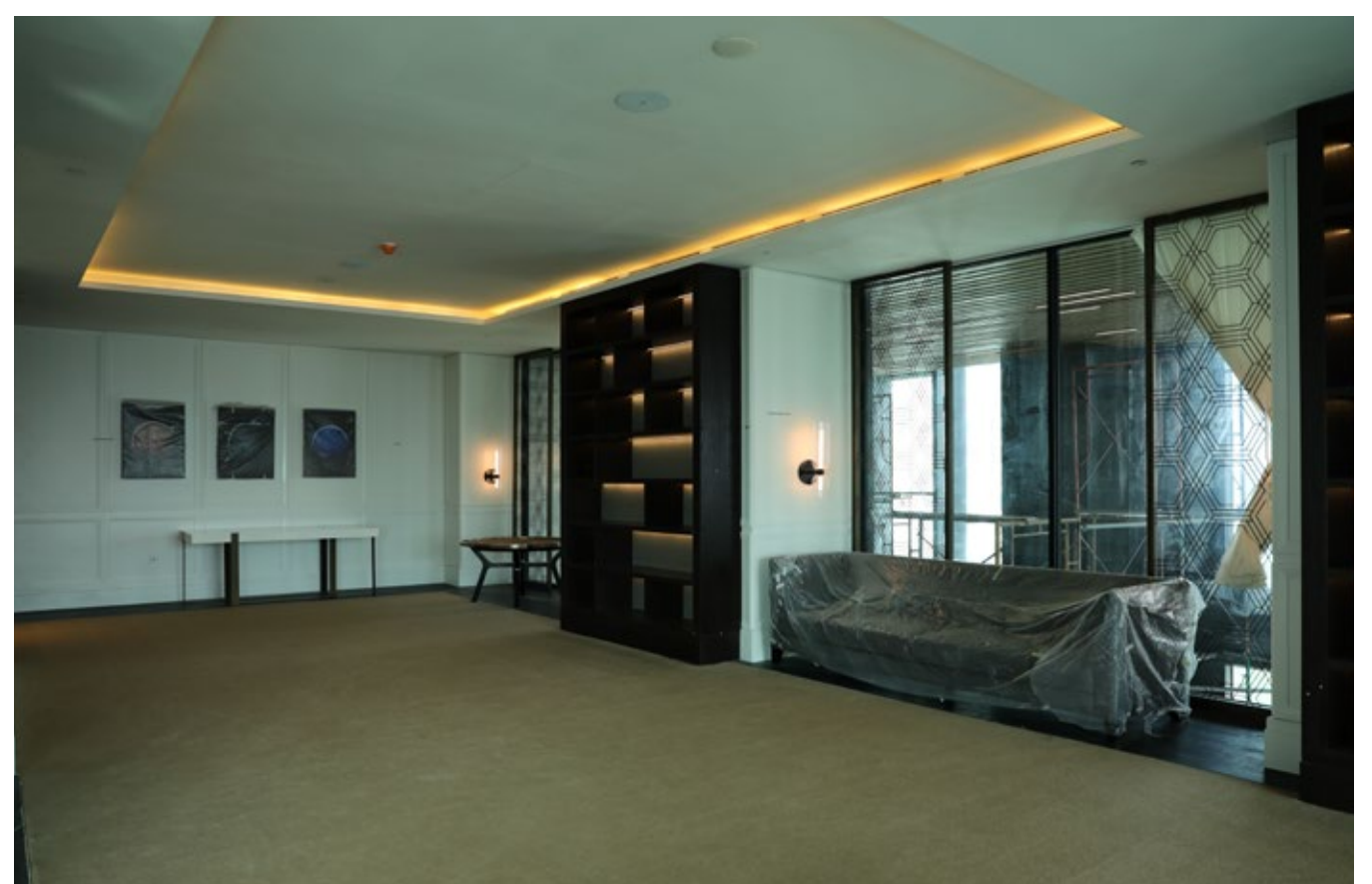
Library is 95% finished. Carpet will be installed on end of August.