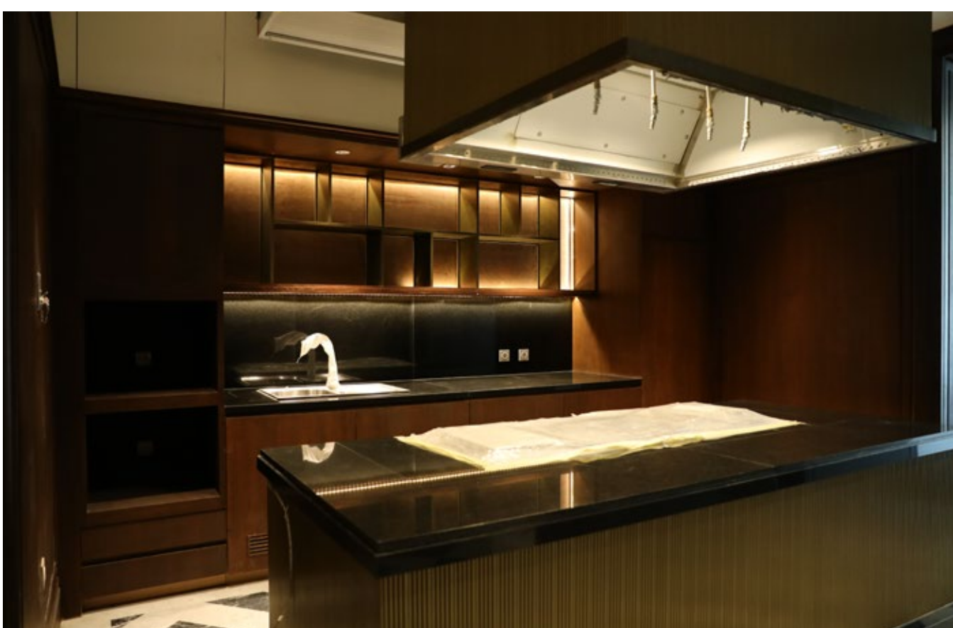
Western Dining Room is progressing smoothly and is almost done.