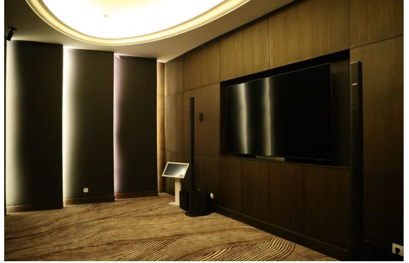
Home Theatre. All bluetooth and audio system is tested and done. Furniture will be installed on end of August.