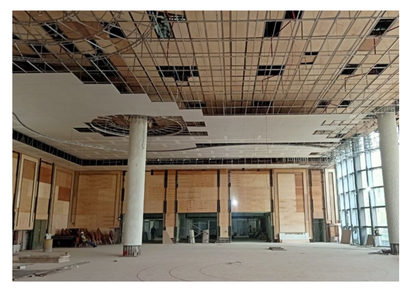
Grand Ballroom: Ceiling and chandelier is 70% done. Chandelier is made by Lasvit and will be installed on February 2022.