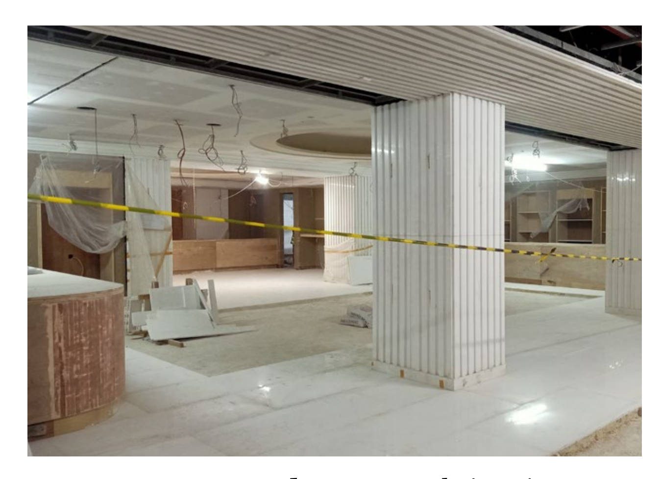
Gourmet Market: ME work, interior, and Bianco Dolomiti marble installation is 70% done.