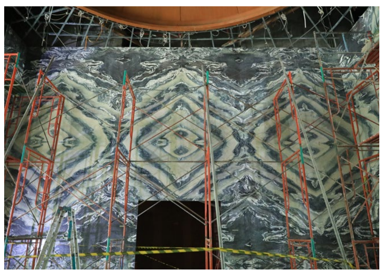
Lobby Concierge: By the end of December 2021, all Callacata Carrara marble are installed on lobby area.