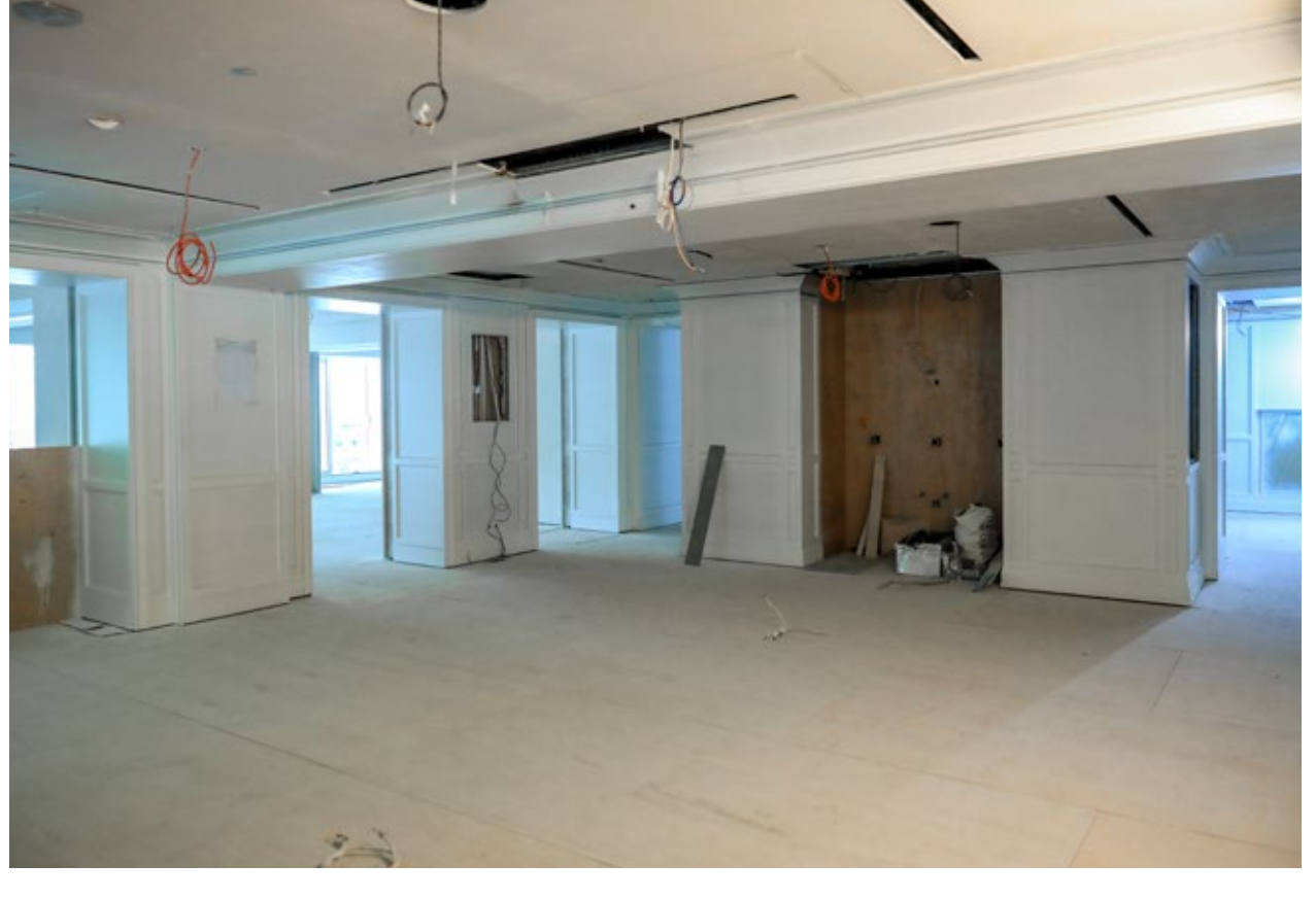
Lumen Meeting Room: ME and finishing work is 70% done. 7 meeting rooms, billiard, board room, music room, and Lumen bar will all be on level 2.