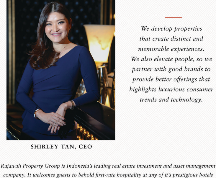
Partnering with St.Regis and Four Seasons, a globally renowned luxury hotel brands,

LIVES AND SPACES ARE TRANSFORMED AT THE HEART OF RAJAWALI'S PREMIUM INVESTMENTS